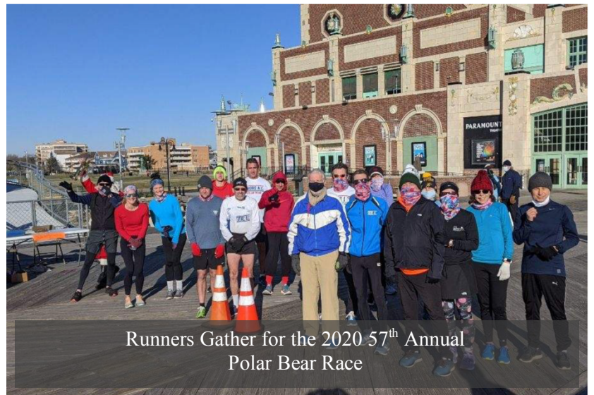
Runners Gather for the 2020 57 th Annual Polar Bear Race