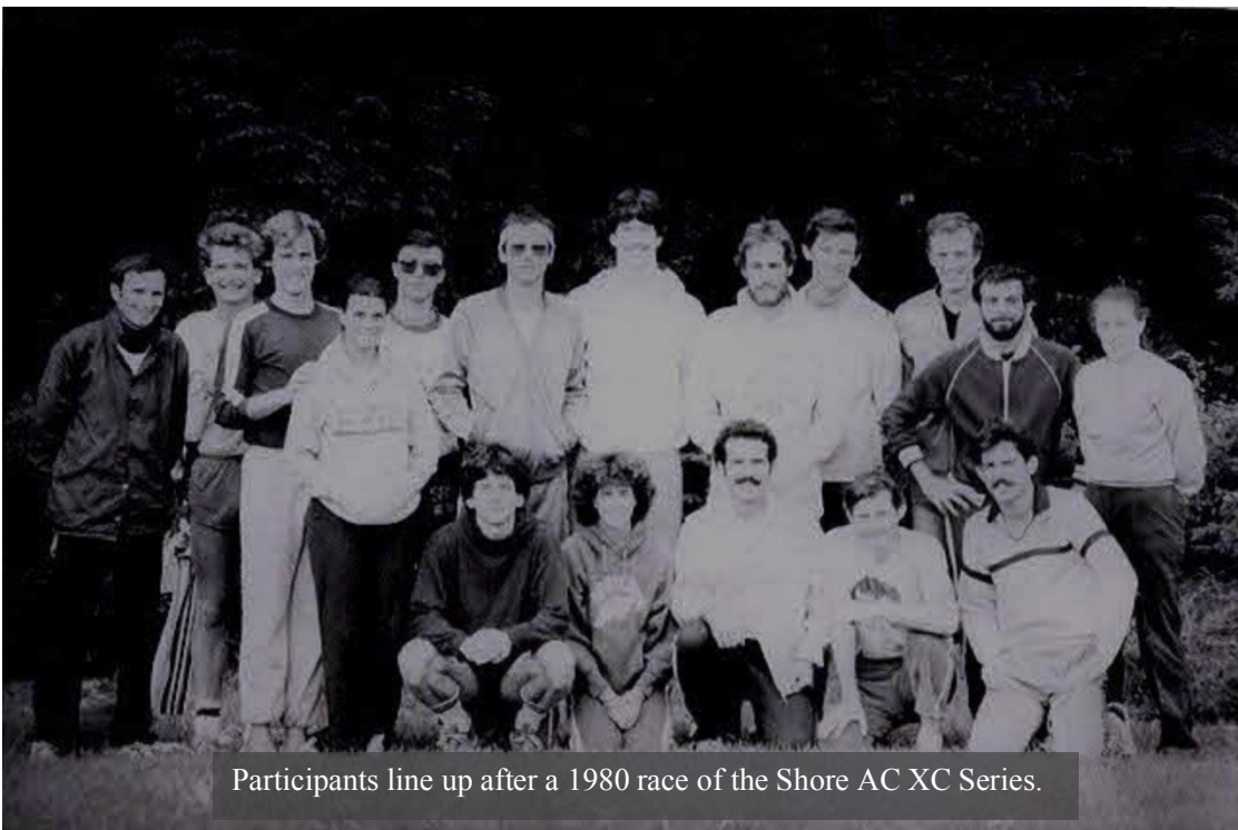
Participants line up after a 1980 race of the Shore AC XC Series.