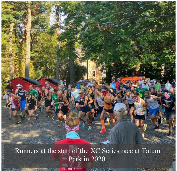
Runners at the start of the XC Series race at Tatum Park in 2020.