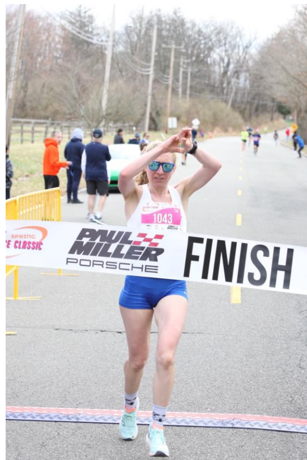
Open: ages 18 – 39