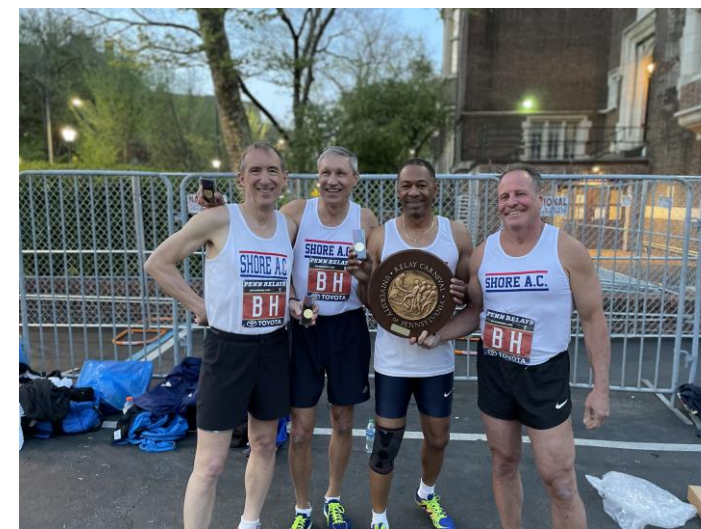
Masters: ages 40+