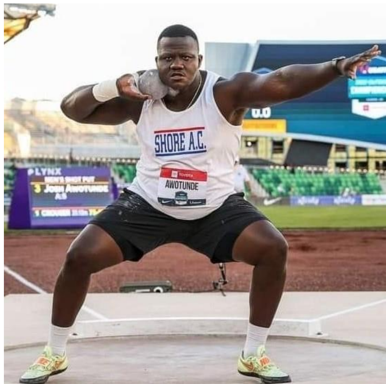
Elite: ages 18+